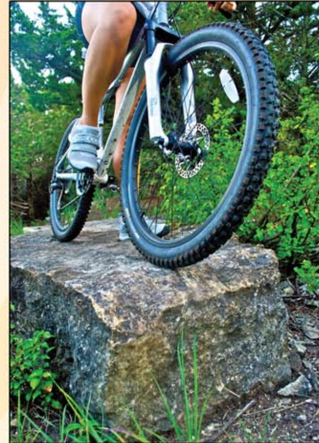
Rock Garden near mile 2