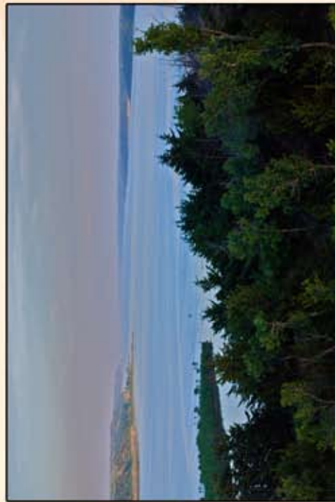
View from Observation Point