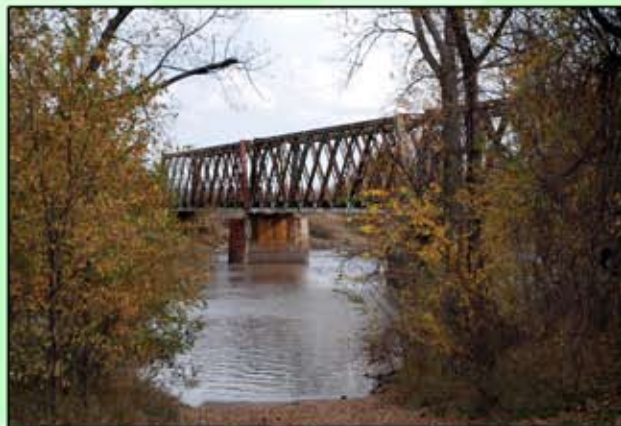
The train bridge from the trail