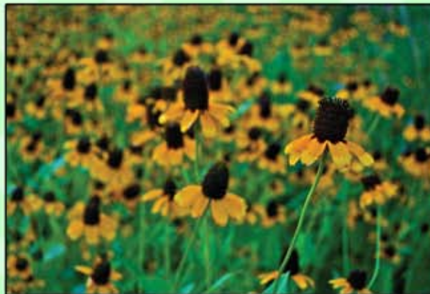
Wildflowers along the trail