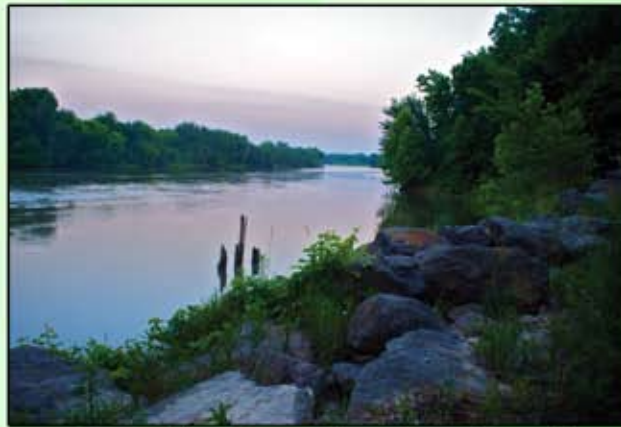
View of the Kansas River from the trail