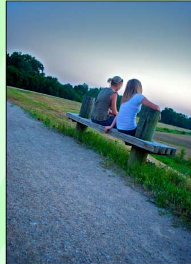
One of the many benches along the trail